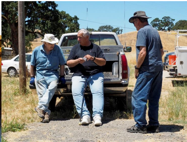
Figuring out why it's not working