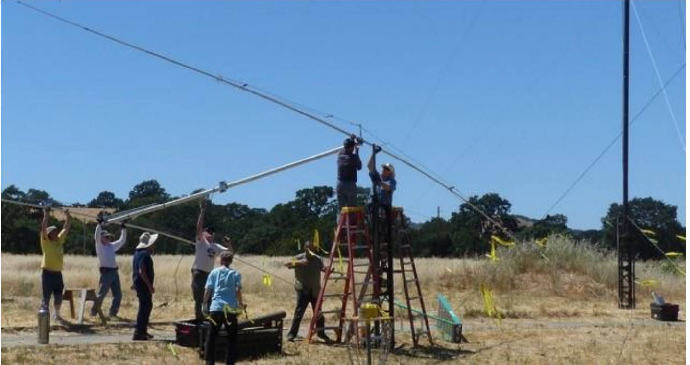
Raising the 40 Meter monster beam