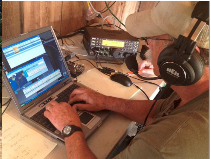
Jerry Foster operating CW station