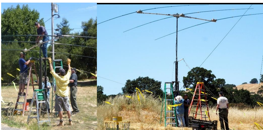
Putting up the beam antenna