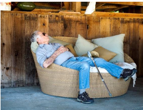
Relaxing between operating shifts