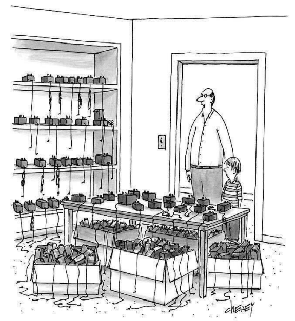
"One day, son, all of these perfectly good A.C. adapters, which have long outlived the products they were originally designed for, will be yours."