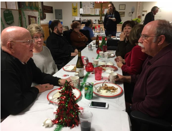
Christmas Party 2016

Pay Online (PayPal) at: Christmas Dinner : http://w6sg.net/christmas_dinner.php On the PayPal page click on the add-to-cart button. (1 works, 2 does not) You may edit the number of attendees in the cart.