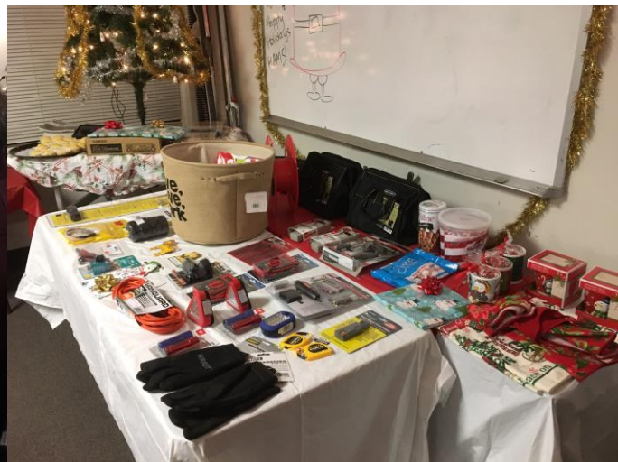
Raffle Prizes Christmas Party 2016