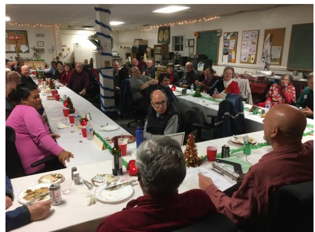
Christmas Dinner 2016

Don't forget we have our annual Christmas dinner on Wednesday, December 6 th . 5:30 at the club house. Last year we had a great turn out, let's do that again this year.