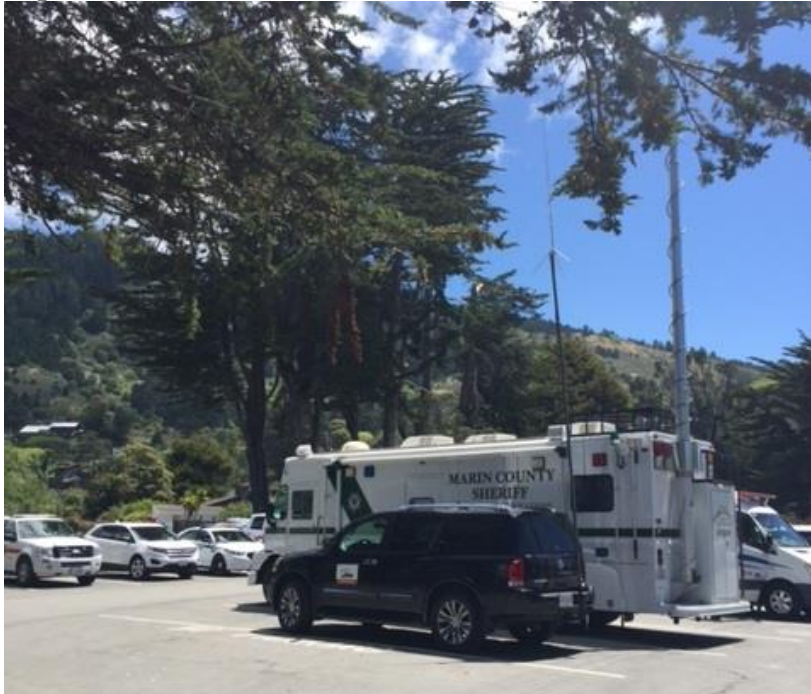
Club net control communications from Marin County Sheriff's mobile command center Stinson Beach