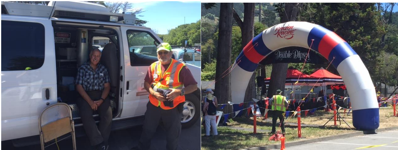
Club net control communications from club communications van and finish line at Stinson Beach