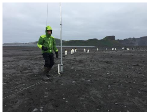
Heard Island Dxpediton 2016, VK0EK

Reprinted with permission ARRL Letter 10/13/16