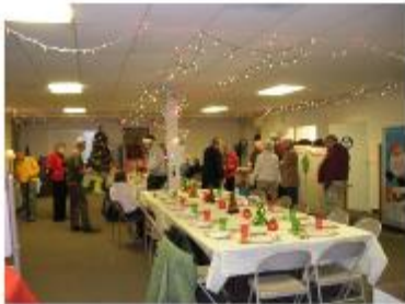
2009 Christmas Party