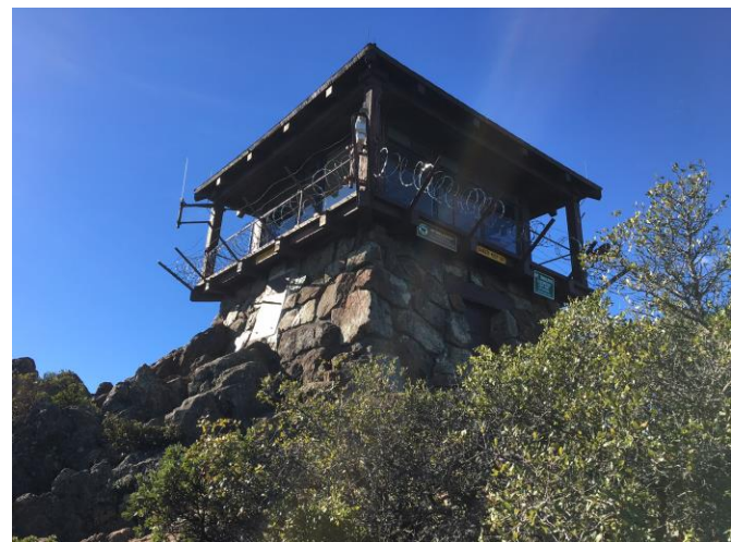
Gardner Lookout, Mt. Tam