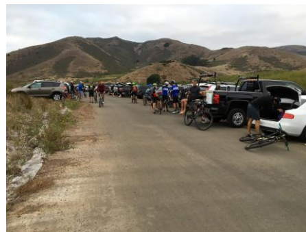
Riders starting the Dirt Fodo