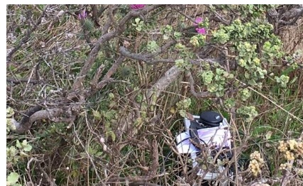
Digipeater on Coyote Ridge Dirt Fodo