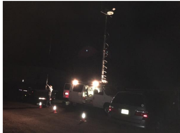
New communications truck in use for Dirt Fodo

The San Francisco Radio Club has activated their new VHF Twin Peaks replacement repeater. This is the second Yaesu "System Fusion" repeater the club has deployed this Centennial year that supports both FM (analogue) and C4FM (digital) communications. The first one is our VA UHF repeater on 444.225 PL114.8. This new VHF repeater is located at Sutro Tower. Frequency:45.150, DCS code: 664