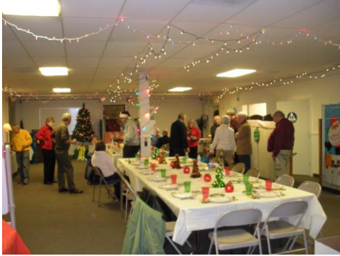
2009 Christmas Party