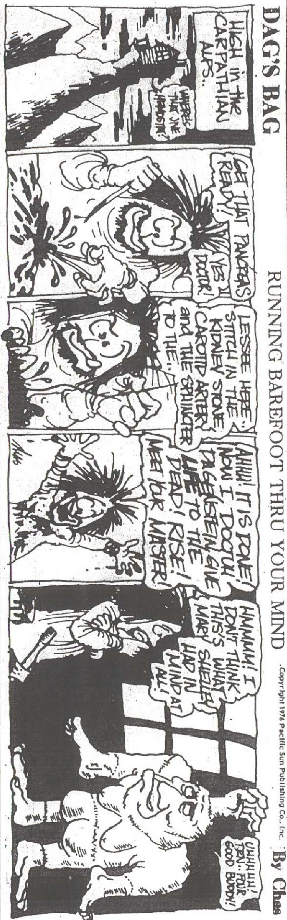
Pacific Sun, Week of November 19-25, 1976

Many of the strips have been preserved in old issues of the Sun in the microfilm drawers of the Marin County Library at the Civic center.