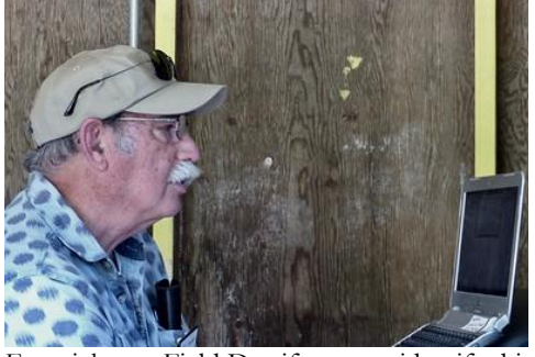
Free ticket to Field Day if you can identify this operator