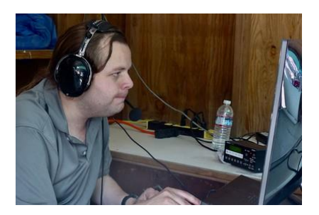
Now that is concentration!