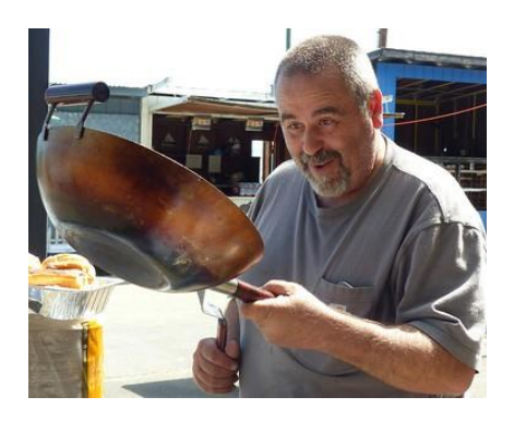
Cal will be back to cook for Field Day

ARRL Field Day, 1800Z, Jun 22 to 2100Z, Jun 23