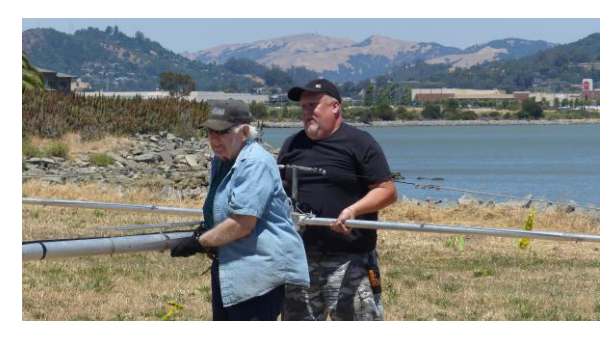
Where are we going with this Beam?