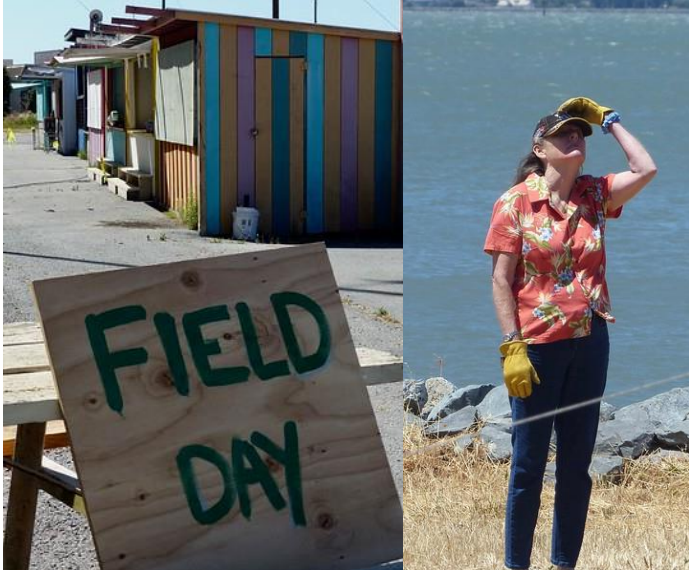
Our operating stations