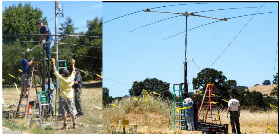
Putting up the beam antenna