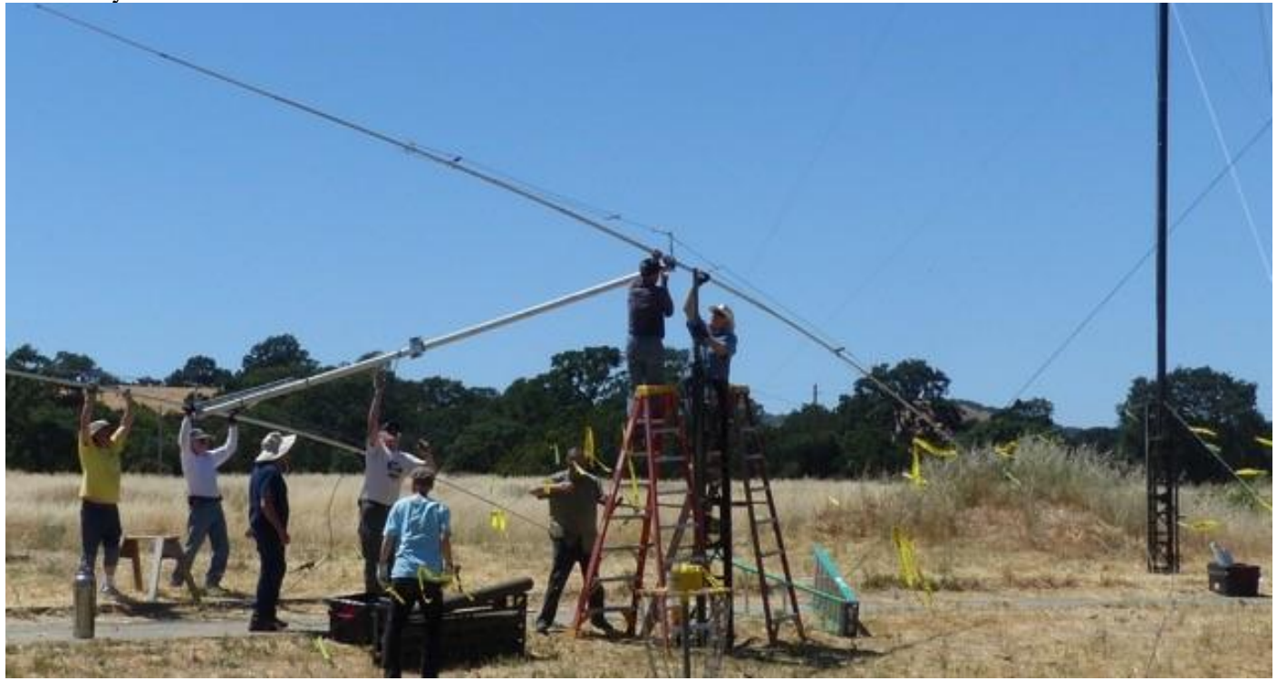
Raising the 40 Meter monster beam