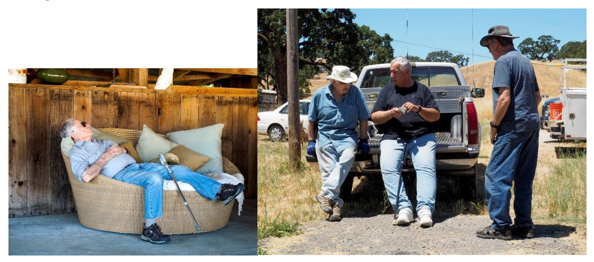
Relaxing between operating shifts